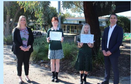
Westernport Secondary College